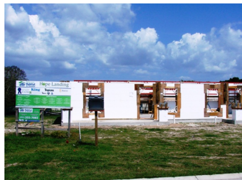
(Left) 40 ft 2 solar hot water and 2.5 kilowatts of PV panels. (Right) Insulated Concrete Form (ICF) walls prior to finishing.