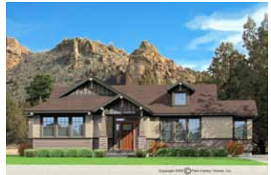
The Tularosa - 2009 IBS Show Village Home built by Palm Harbor Homes Tempe

Based on this existing partnership, new single-family homes that are certified Silver, Gold, or Emerald to the Standard can be concurrently certified to the U.S. Department of Energy's (DOE's) Builders Challenge.