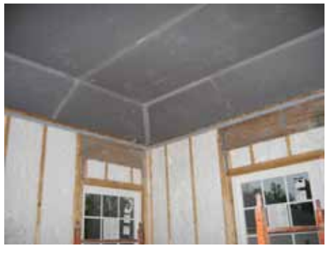
Sealed drywall at ceiling