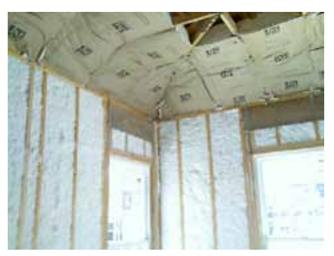
Continuous formaldehyde free fiberglass blown insulation