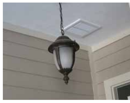
Outside air inlet with filter back grille delivers fresh air to return side of AHU

The Tommy Williams ZEH Longleaf offers many noteworthy, energy efficient features. Several features in particular are the home's thermal shell, air distribution and passive design strategies.