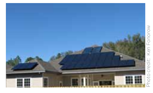
6.75kWp PV system with 64 sq. ft. solar hot water system

First, teams analyze and select costeffective strategies for improving home performance. Next, teams evaluate