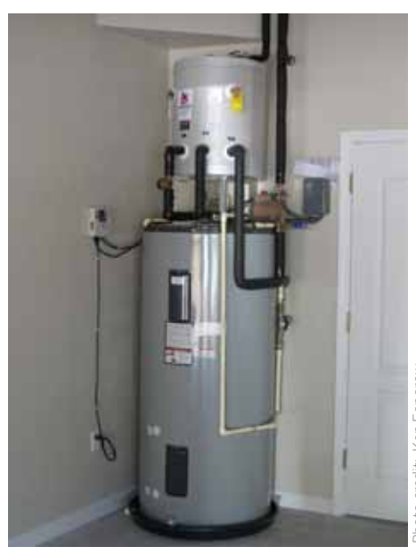
120 gallon storage hot water tank with drain back tank above

Tommy Williams embarked on their second zero energy home and their first