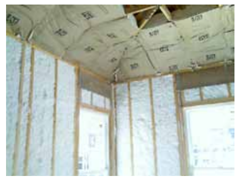
Continuous formaldehyde free fiberglass blown insulation