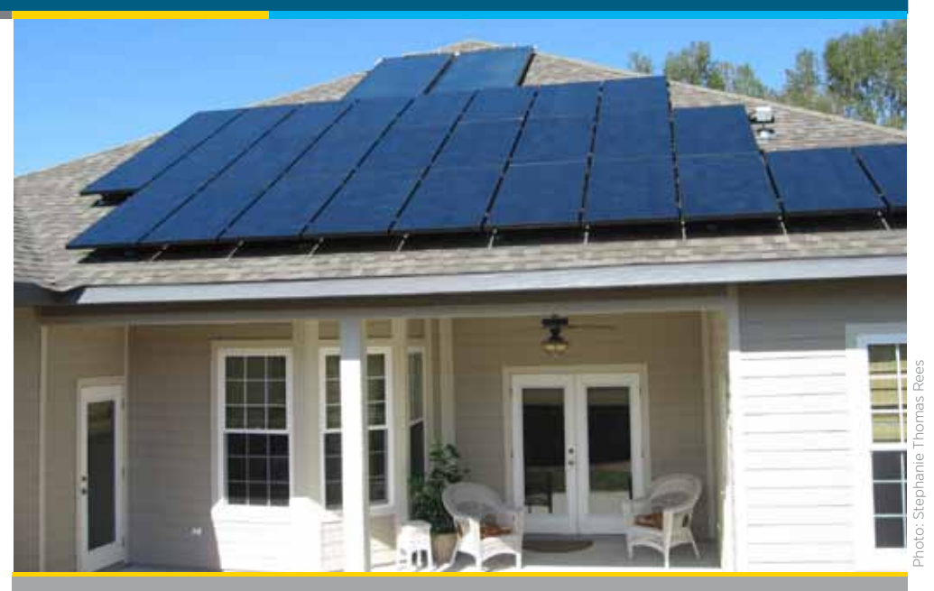
Tommy Williams Homes, Zero Energy Home • Longleaf • Gainesville, FL 2,250 square feet • 3 bedrooms, 2.5 bathrooms