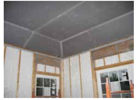
Sealed drywall at ceiling