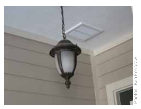
Outside air inlet with filter back grille delivers fresh air to return side of AHU

The Tommy Williams ZEH Longleaf offers many noteworthy, energy efficient features. Several features in particular are the home's thermal shell, air distribution and passive design strategies.