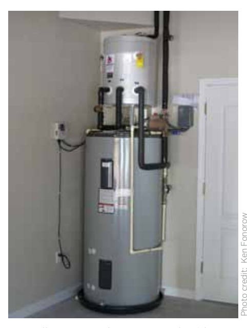
120 gallon storage hot water tank with drain back tank above

Tommy Williams embarked on their second zero energy home and their first "entry-level" zero energy home. This home is in the Belmont neighborhood.