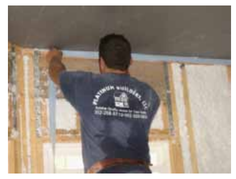
Foam gasket at ceiling/wall joints ensures airtightness

an annual year. The table below shows the home's HERS Index with and without the renewable energy features.