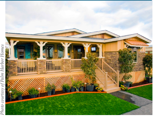
The La Linda - 2010 IBS Show Village Home built by Palm Harbor Homes

To learn more about the Buildiers Challenge and find tools to help market your homes visit www.buildingamerica.gov/challenge