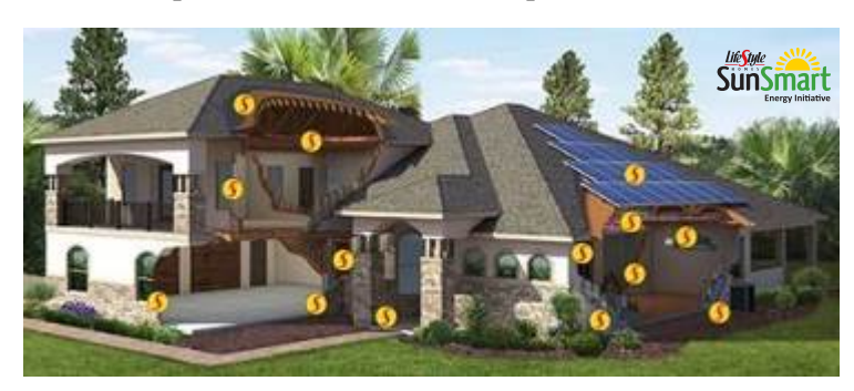
Figure 1. On the website cut-away, each yellow marker links to a SunSmart element. Viewers get brief overviews of the technical concepts and answers to "Why should you care?"

The big picture message: LifeStyle has done the homework for buyers. Their leadership says, "It is the communication of the overall benefits of the package that sells the homes, not a description of the individual components."